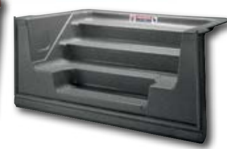
8' Four-Tread Straight Sit 'N Step Available in Standard and Cantilever STRAIGHT AND RADIUS MODELS